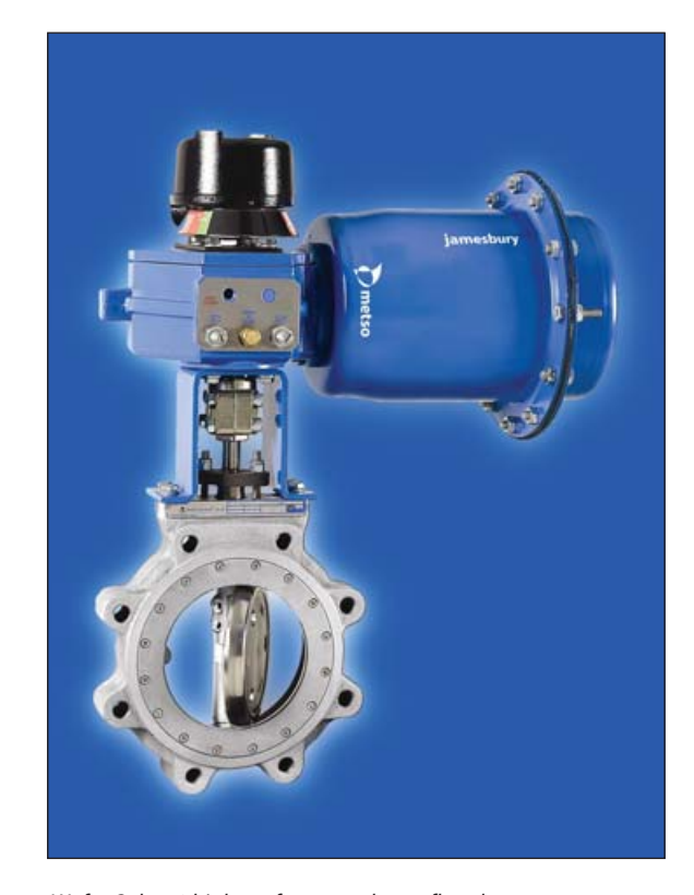
Wafer-Sphere® high-performance butterfly valves provide a cost-effective solution for a wide range of applications where bubble-tight shutoff and trouble-free cycles are required. Fire-Tite® Wafer-Sphere butterfly valves are available for applications where API 607 is a requirement.