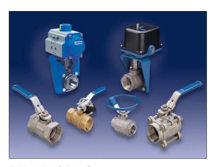
The Value-Line® Series of ball valves offers consistent, reliable performance at a very competitive price.