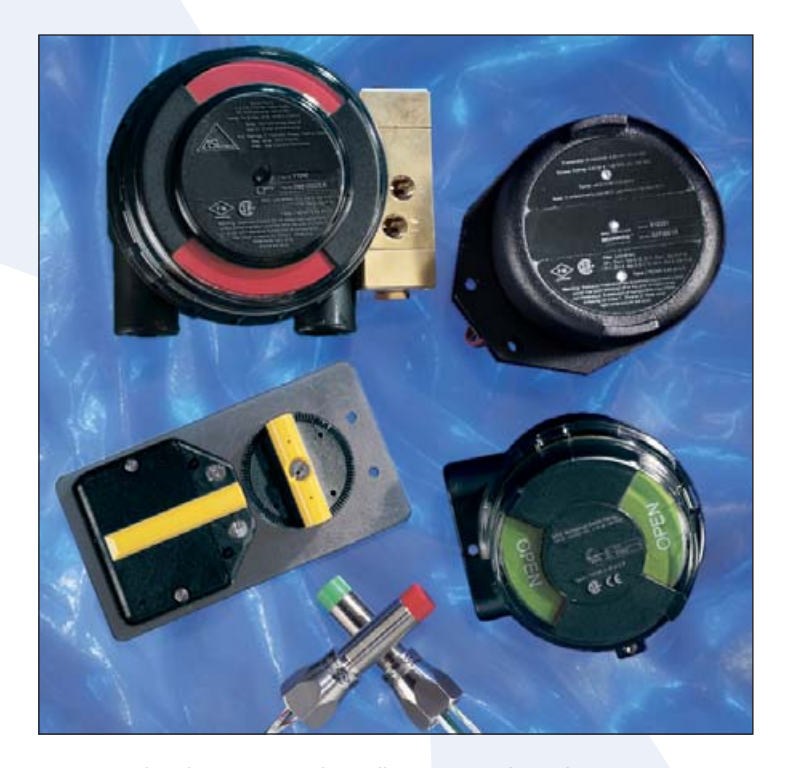
Our Networking by StoneL® products allow users to select valve products appropriately configured for fast, reliable connection to a full range of bus network platforms, including AS-I, DeviceNet and Foundation Fieldbus.