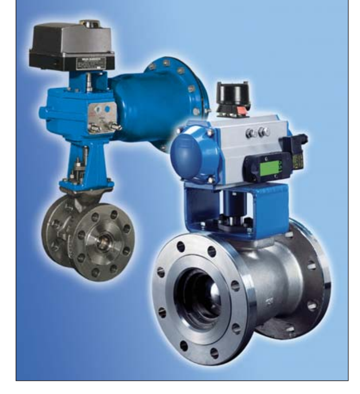
Jamesbury<sup>®</sup> high-performance ball valves meet the requirements of a full range of applications, including clean and dirty fluids and flammable liquids and gases at high flow rates.