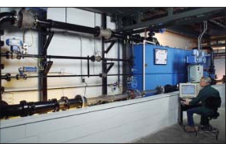
We test our valves under actual process conditions in our advanced flow lab to ensure our solutions perform as promised in your application.