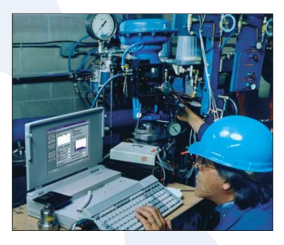
Jamesbury field service technicians are available 24/7 to help you with product and process-related challenges.