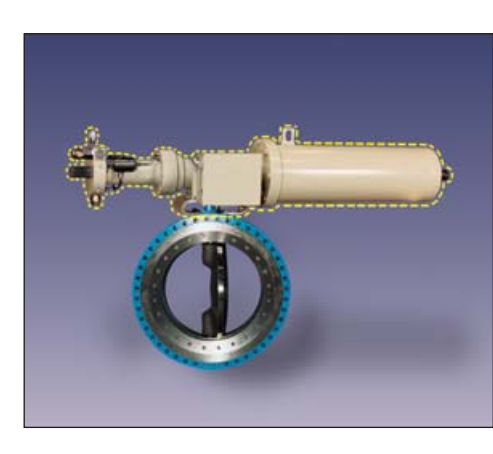
Our MatchMaker certified automation program for automated assemblies assures that valves and actuators are engineered as one and backed by our full warranty.*