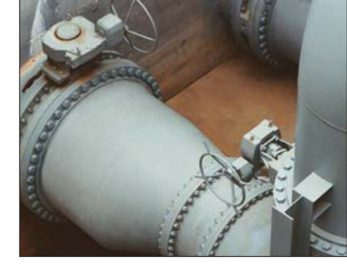
Jamesbury valves have been proven in thousands of real-world applications to reduce total process costs.

* Program does not extend to the performance of the individual non-Jamesbury component.