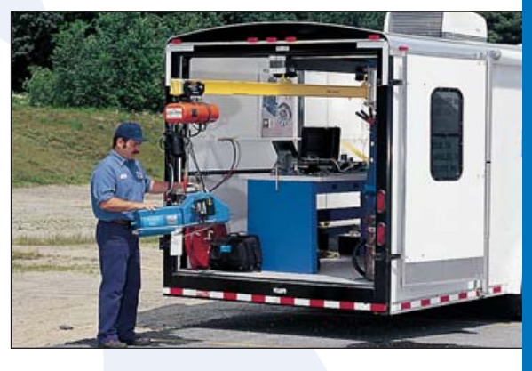
The value of a Jamesbury solution doesn't stop at the initial purchase. We provide 24/7 technical field service, in-depth training, and extensive service and support.