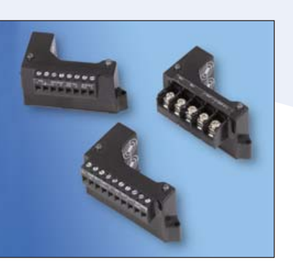
Rugged solid-state modules help ensure that our valve communication and control devices perform reliably in hazardous conditions.

Our commitment to quality even extends to our responsibility for package performance when delivering network-capable valves consisting of mixed brand components under our MatchMaker® Program. Plus, should you ever require assistance with your solutions, you can rely on a service and support program that is as comprehensive as the line of network-capable valving we offer.